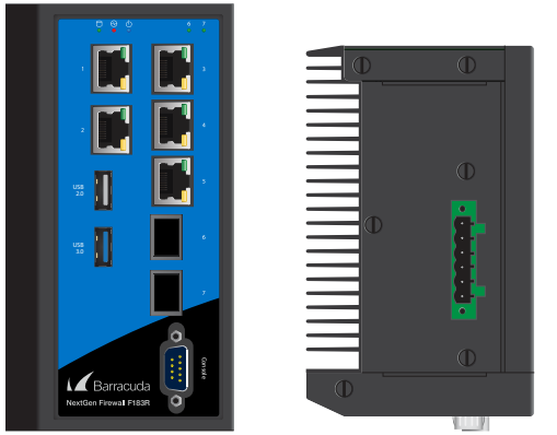
Barracuda CloudGen Firewall F183R, front and top view

Centralized management with the Firewall Control Center fully integrates the rugged appliances in a large and dispersed ICS network.