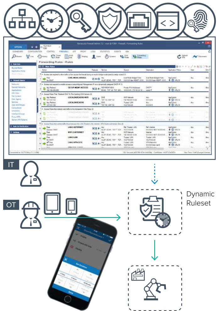
Grant remote access to specific deployments via an app

Your IT admin can configure granular permissions to let specified Operations staff open a predefined remote VPN connection, and authorize a third party to use it, via phone or tablet. Onsite Operations staff need no IT expertise.